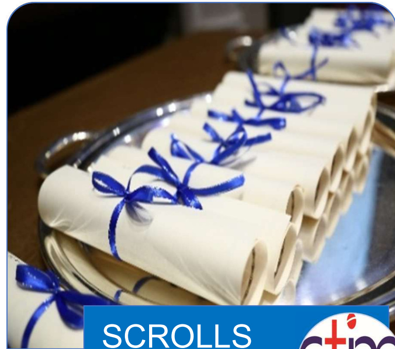
SCROLLS for Graduates