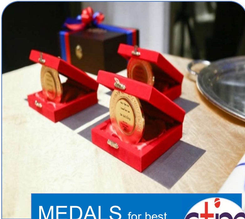
MEDALS for best performance in tax papers