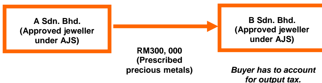
Figure 2: Acquisition of Prescribed Precious Metals from Approved Jeweller

18. Normally, an approved jeweller would acquire the prescribed precious metals from bullion houses or banks. However, he is allowed to acquire the prescribed precious metals from another approved jeweller under AJS. This means that his supplier who is also an approved jeweller is required to charge tax on the supply made to the approved jeweler but is not liable to account for the output tax. The recipient of the prescribed precious metals has to account for output tax on the purchase of the prescribed precious metals. The transaction is illustrated in example below.